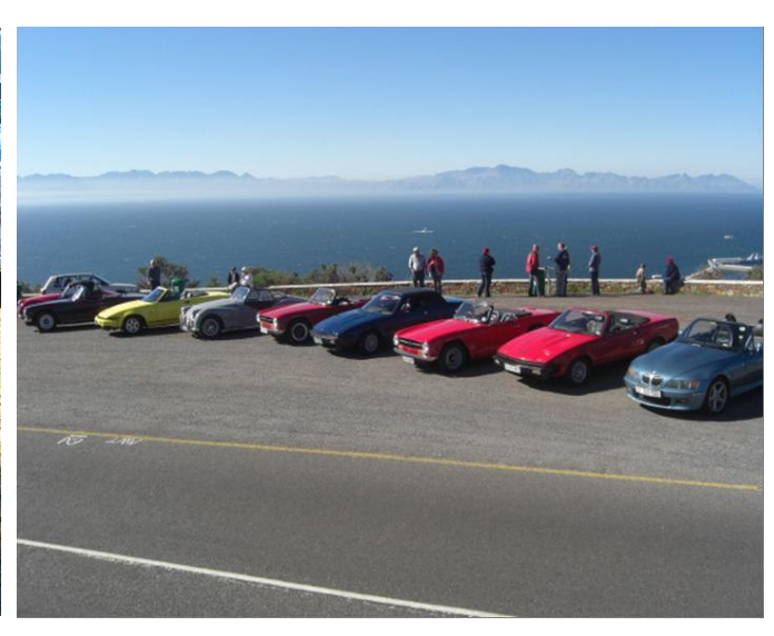
At the top of Red Hill overlooking False Bay